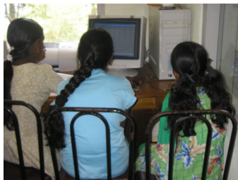
Idulgashinna children attending a computer class