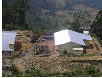
Example of a newly completed house on the estate