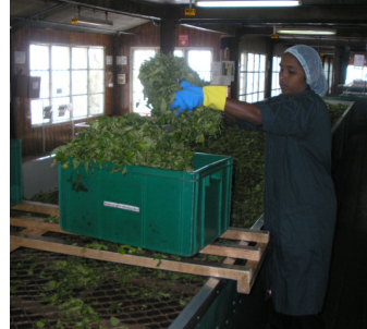
Drying the green leaves at the Idulgashinna Organic Bio-tea factory.