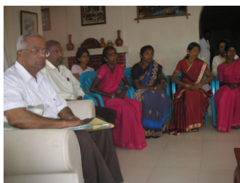
Members of the Idulgashinna Social Development Committee

Here are a few of the things that members of the Idulgashinna Social Development Committee (pictured) told Tradewinds when asked about the difference the project had made in their lives: